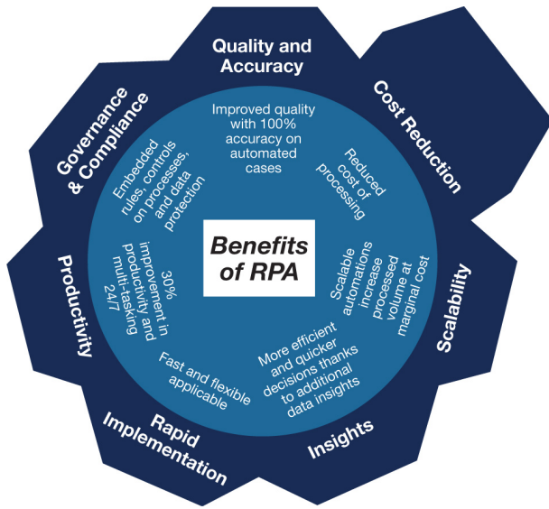
Figure 1: Benefits and cost savings associated with RPA